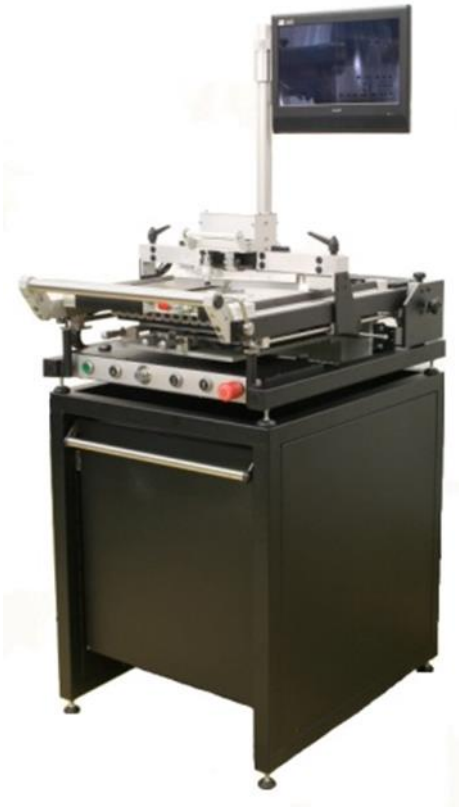
• S40 with stand and stencil magazine